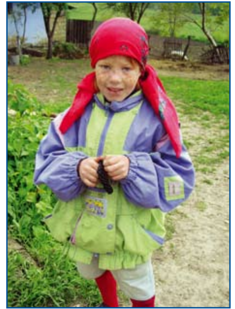
It's never too late to please a child.